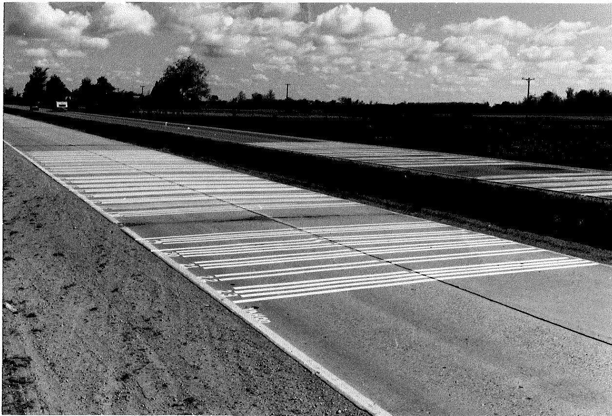
Figure 1. Initial appearance of test stripes on US 27, north of Price Rd, looking north. Right roadway is bituminous while left roadway is concrete. Foreground stripes on the concrete are the white paints (5/24/74).