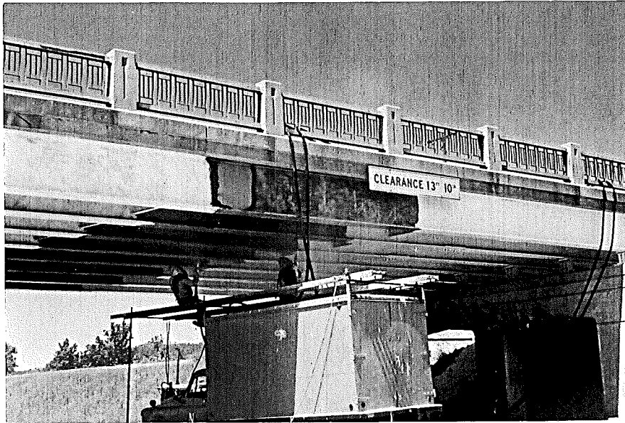
Figure 1. Truck scaffolding in position for sandblasting of bridge steel prior to maintenance painting, requiring the closing of one lane of traffic.