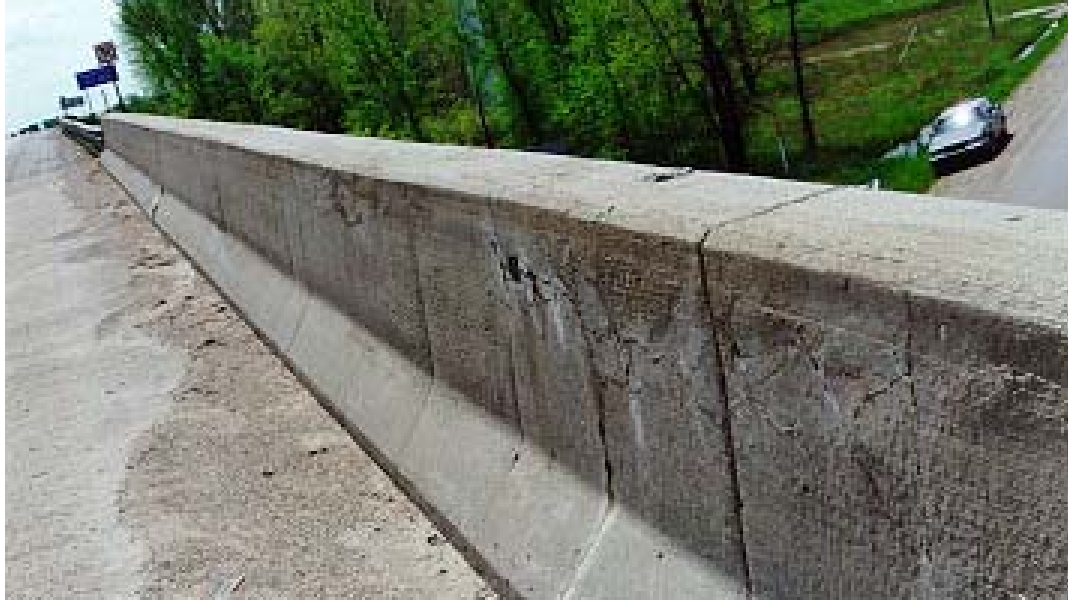
Figure 5: Typical New Jersey (Type 3) concrete barrier adopted in 1977.

On October 14, 1982, the MDOT Engineering Operations Committee (EOC) requested the standard design details for the New Jersey design be further modified. This was based on concerns raised by the Federal Highway Administration (FHWA) that MDOT's current Types 2 and 3 barriers were over-designed. Based on these concerns, the cross-sectional widths were reduced and reinforcement details were modified. Hence, the New Jersey (Types 4 and 5) concrete barriers were developed. These new standard design configurations (Types 4 and 5) resembled the previous standard designs (Types 2 and 3), respectively. However, the detail (Types 4 and 5) modifications reduced the cross-sectional widths to 8" at the top and 1'-6" at the base. Illustrations of these standard barriers types are shown in Figures 6 and 7.