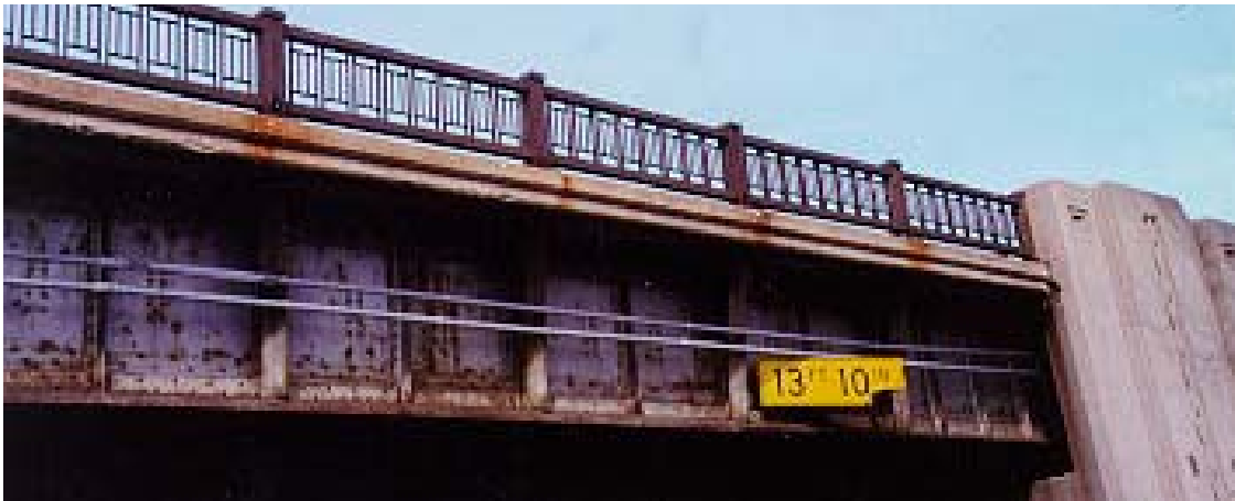
Figure 1A and 1B: Typical R-4 or R-5 standard bridge railing design prior to 1960.

Prior to the 1960's, the standard bridge railing types used in Michigan were the Types R-4 and R-5. These railings were constructed of either concrete (R-4) or steel (R-5) posts with metal lattice between posts. Illustrations of these two railing types are shown in Figures 1A and 1B. Depending on the specific application and location, some of these railings, or modifications to them, are still in service today. In addition to the Types R-4 and R-5 railings, other typical railing construction details incorporated extensive use of cast-in-place architectural concrete, and various renditions of rolled and tubular steel designs.