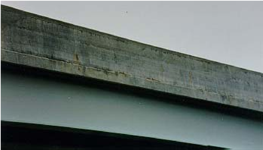
Figure 18A and 18B: Typical advanced deterioration of horizontal crack. Note the oxidation staining from the black reinforcing steel, further leading to expansion and ultimate failure of the concrete due to corrosion expansion.

the top 4 inches of the barrier supported by the top longitudinal reinforcement is restrained from settlement as its parent the lower mass slumps downward. The early-age tensile stresses experienced at the interface between the supported top concrete and the slumping lower concrete mass produce longitudinal micro-cracks not noticeable to the naked eye. Over time, the top 4 inches of the barrier breaks away, either as a result of corrosion of the reinforcing steel, thermal stresses, or from deterioration caused by freezing and thawing of the moisture within the concrete. This mode of deterioration is a noted concern especially at structures where falling concrete is a safety hazard. This can be seen in Figures 18A and 18B.