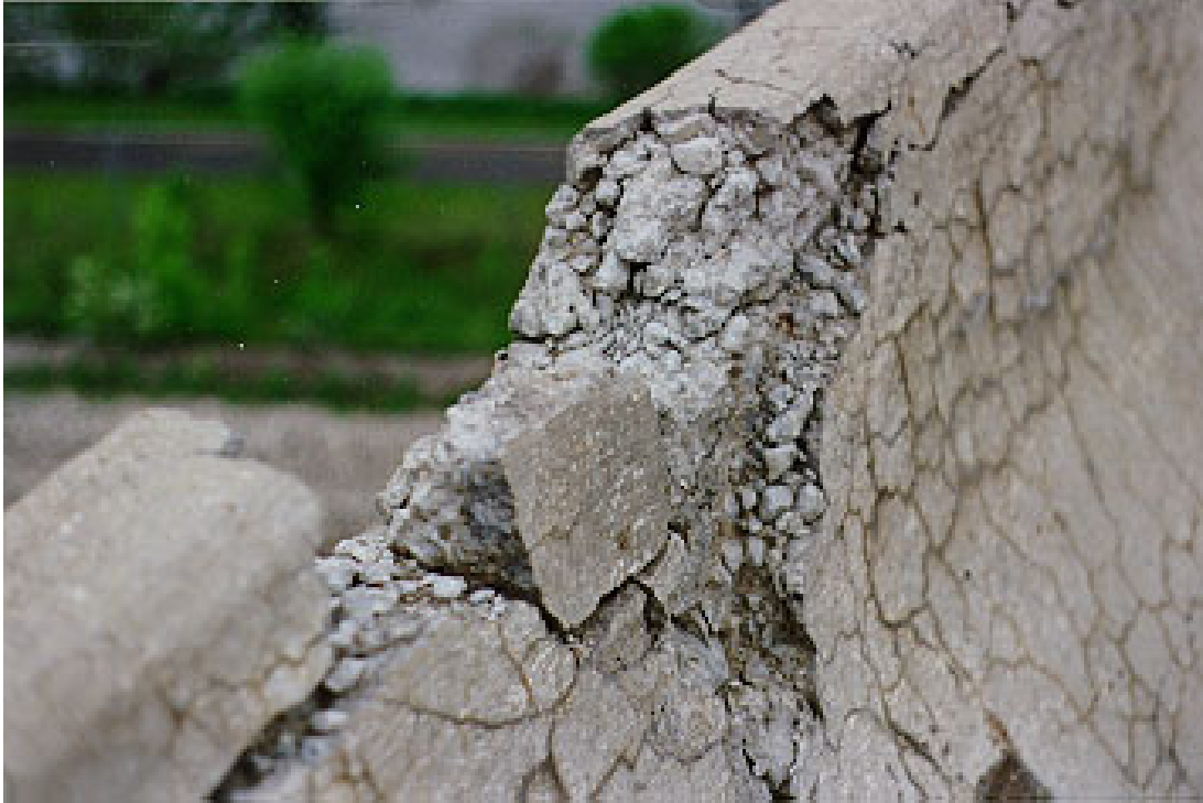
Figure 23A and 23B: Barrier on SB US-23 over the Huron River in Washtenaw County constructed in 1988.