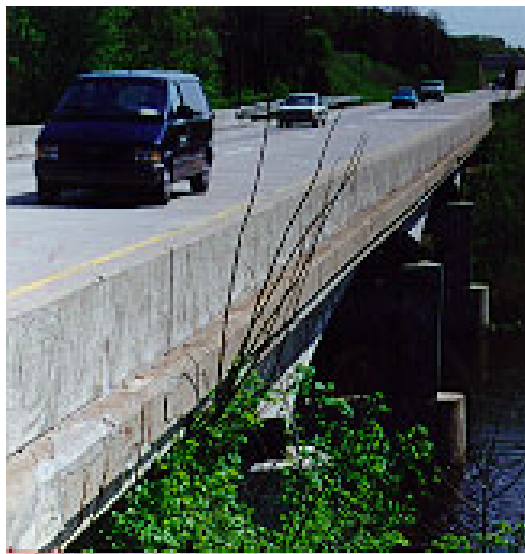
Figure 6: Typical New Jersey (Type 4) concrete barrier adopted in 1982.

On October 14, 1982, the MDOT Engineering Operations Committee (EOC) requested the standard design details for the New Jersey design be further modified. This was based on concerns raised by the Federal Highway Administration (FHWA) that MDOT's current Types 2 and 3 barriers were over-designed. Based on these concerns, the cross-sectional widths were reduced and reinforcement details were modified. Hence, the New Jersey (Types 4 and 5) concrete barriers were developed. These new standard design configurations (Types 4 and 5) resembled the previous standard designs (Types 2 and 3), respectively. However, the detail (Types 4 and 5) modifications reduced the cross-sectional widths to 8" at the top and 1'-6" at the base. Illustrations of these standard barriers types are shown in Figures 6 and 7.