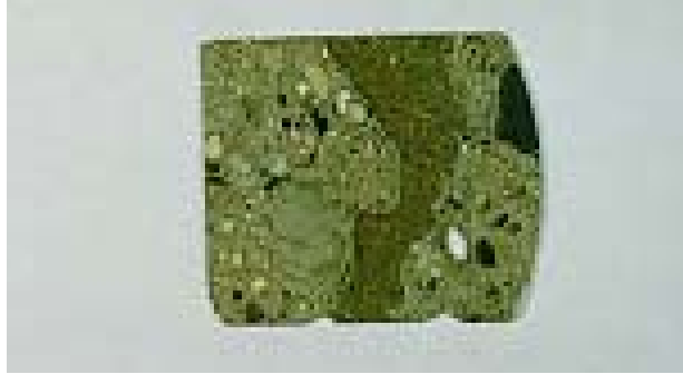
Figure 15: Lens of sand detected in concrete core specimen sampled from slipform barrier. The lens was observed to be located within approximately 6 mm from the traffic-bearing surface.