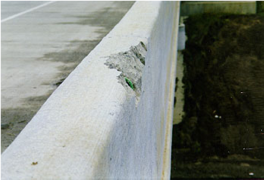
Figure 19: Early-age surface failure of barrier at Alward Road over US-27 in Clinton County.

Observations supporting even early-age potential problems at this interface were noted on two newly constructed barriers at Walker Road and Alward Road over US-27 in Clinton County. At these locations, approximately 18 inches longitudinally along the top surface of two of the barriers delaminated to the depth exposing the top longitudinal No. 4 reinforcing bar and stirrup. Voids were noted under the steel at the exposed locations which also are believed to have contributed to suspected stress concentrations and eventual breakaway spalling of concrete surface at these locations. Figure 19 shows the early-age surface failure of the barrier at Alward Road just six weeks after barrier construction.