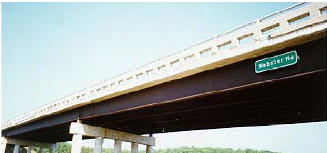
Figure 2A and 2B: Concrete railing typical of the standard R-11 or R-12 adopted in 1961.

The open parapet concrete railing with aluminum or steel tube (Types R-11 or R-12) was adopted as the standard railing detail in 1961. These railings were used throughout the 1960's and 1970's. Illustrations of a typical open parapet railing with aluminum railing on a structure constructed in 1974 are shown in Figures 2A and 2B. In 1967, the G.M. (Type 1) concrete barrier was approved as the standard barrier detail for trunkline applications. The general shape of this barrier is similar to modern standard details, with exception of the G.M.'s optional tube railing and dimensional modifications. Figure 3 illustrates a typical G.M. (Type 1) detail configuration. The G.M. (Type 1) barrier was shorter in overall height and narrower in cross-sectional width than today's standard design; only 2'-8" high, 6" wide at the top, and 1'-4" wide at the base. According to field inspections, some G.M. barriers are still in service today; many were still observed to be in excellent condition. In 1976, the "New Jersey" (Type 2) concrete barrier design was adopted for use in Michigan.