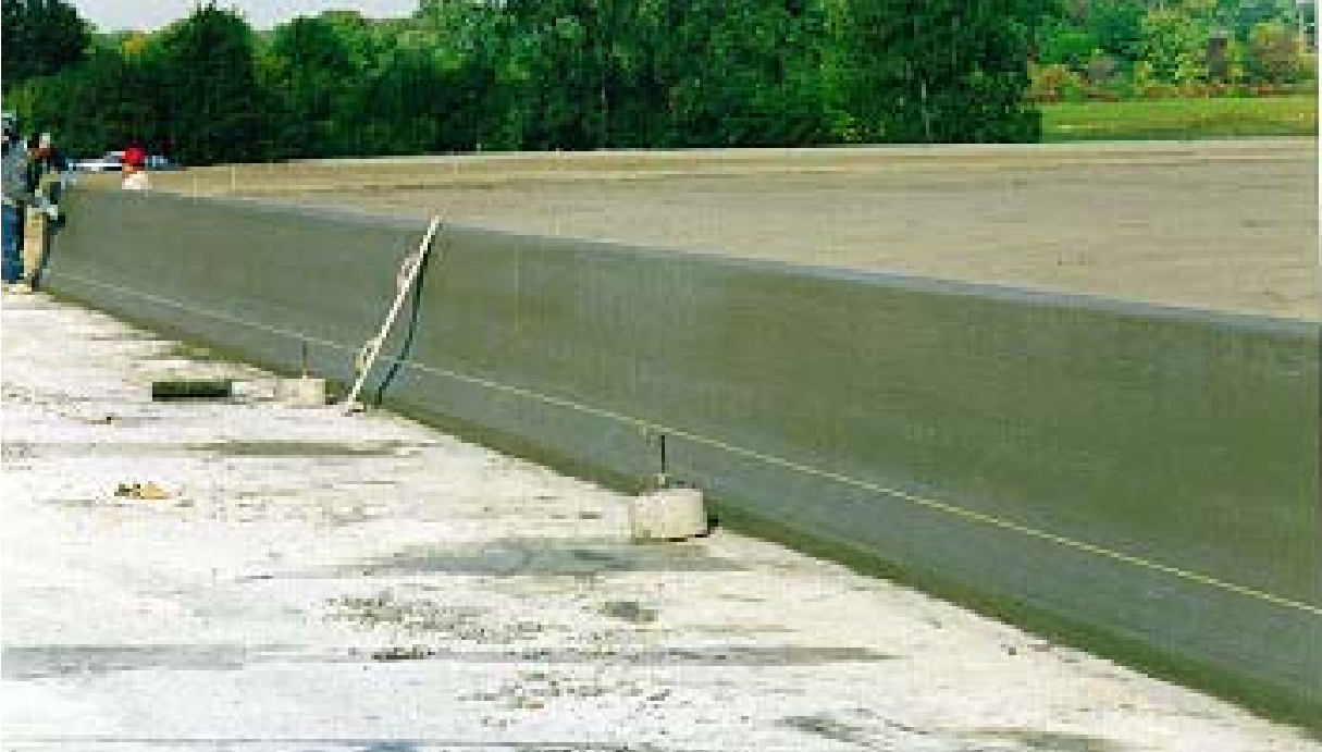
Figure 9: Typical “slipform” concrete barrier operation.

The Portland cement concrete specified for barriers and railings is a typical superstructure grade containing MDOT standard Series 6AA coarse aggregate. The Series 6AA coarse aggregate used in this structural application permits the use of materials originating from either geologically natural or manufactured sources. A common source of manufactured coarse aggregate in Michigan is air-cooled iron blast-furnace slag; a by-product from the steel production industry. Portland cement concrete used in bridge barriers is designated as “superstructure quality” grade concrete. However, MDOT specification requirements prohibiting the use of slag coarse aggregates for superstructure applications are currently limited to the bridge deck only. Many bridge (as well as roadway median) barriers in the metropolitan Detroit area are constructed using air-cooled blast-furnace slag.