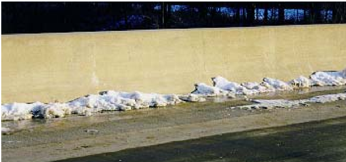
Figure 12: Example of snow build-up on southerly faced traffic-bearing concrete surface.

It is evident by field observations that since open parapet railing systems do not trap a significant quantity of deicer contaminated snow against their traffic bearing face, accelerated deterioration effects are not pronounced. However, with increased use of anti-icing/deicing agents, observations show some brush blocks and curb faces on older open parapet railing having been in-service since the late 1960's, are only now showing signs of aggressive deterioration. Some older railings are also experiencing similar signs of deterioration on their exposed vertical