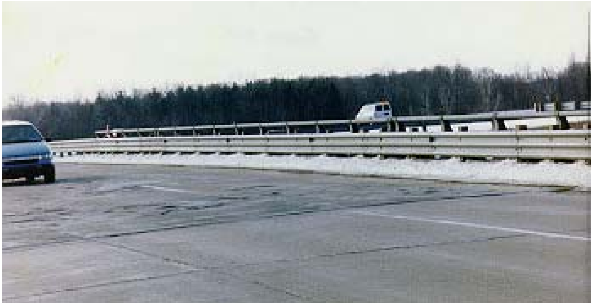
Figure 13A and 13B: Example of open parapet concrete railing retrofitted with beam guardrail.

faces. However, many are still in excellent condition. One method to retrofit the open parapet railings still in-service on main trunkline routes is to face it with beam guardrail across the structure, attaching it to the bridge railing. To a certain extent, facing the bridge railing with guardrail could aid toward protecting the concrete from aggressive deterioration. An example of an open parapet concrete railing retrofitted with beam guardrail is shown in Figures 13A and 13B.