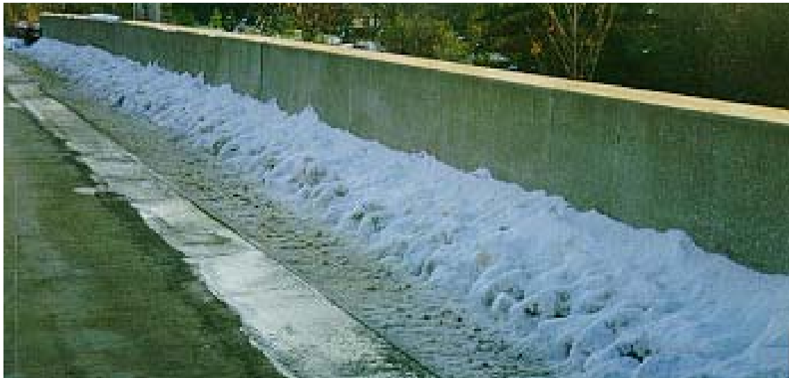
Figure 11: Example of snow build-up on northerly facing traffic-bearing barrier surface.

snow, built-up against the barrier from highway snow removal operations, melts and freezes daily. Thawing snow concentrated against the lower face of these barriers feed moisture into the concrete surface contributing to induced hydraulic and osmotic pore pressures, which were discussed earlier. The snow build-up against the northerly faced traffic-bearing surfaces experiences very little solar warming and, therefore, remains in a cryonic state for a longer period. As long as the snow remains frozen, the accelerated cyclic fatigue brought on by the movement of pore fluids is temporarily stabilized. This can be seen in Figures 11 and 12.