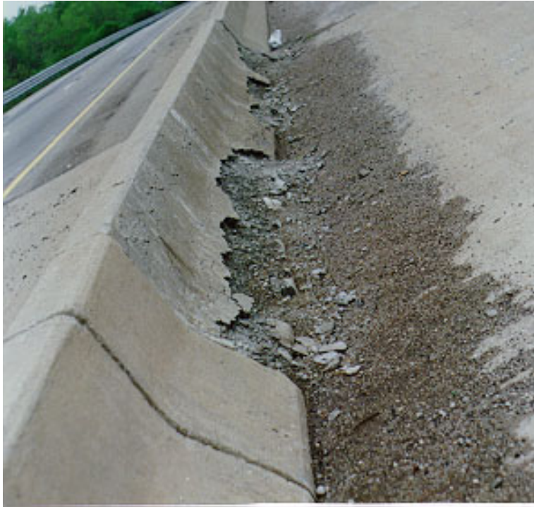
Figures 10A and 10B: Typical deterioration caused by freeze thaw attack.