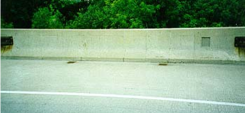
Figure 7: Typical New Jersey (Type 5) concrete barrier adopted in 1982.