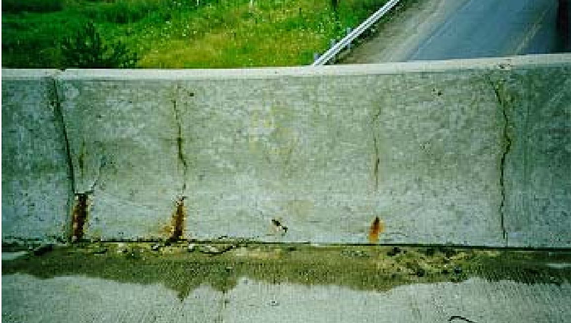
Figures 21A and 21B: Examples of corrosion of black reinforcing steel due to insufficient concrete cover.