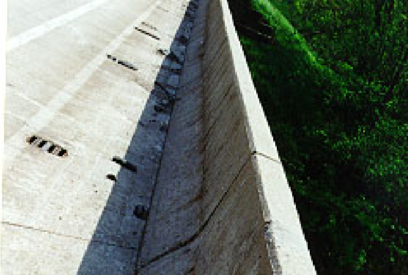
Figure 3: Typical G.M. (Type 1) concrete barrier adopted in 1967.

Figure 4 illustrates a typical New Jersey (Type 2) detail configuration. Differences between the two standard design configurations (G.M. vs. New Jersey) are dimensional modifications to the toe and sloping face of the traffic bearing side. The cross-sectional widths at the top and bottom of the New Jersey (Type 2) barrier were also increased to 1'-0" and 1'-10", respectively. Several revisions to the standard design were adopted during the 1970's, including optional tube railings.