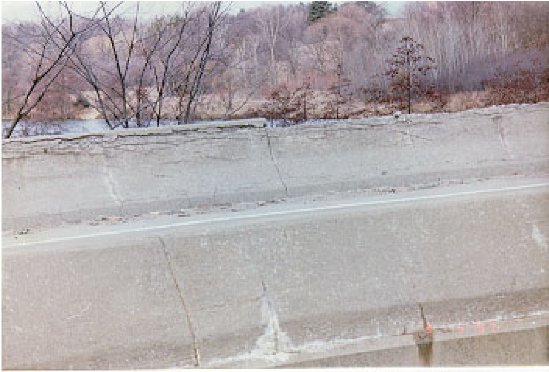
Figure 24A and 24B: Barrier on SB US-23 over the Huron River in Washtenaw County constructed in 1988.