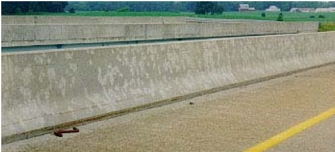
Figure 16: S02 of 19042, WB I-69 over US-127 near Lansing, MI. Constructed in 1985, this concrete barrier is a typical example of cast-in-place construction. This barrier is nearly crack-free.

It is interesting to observe the divergence in performance between the conventional cast-in-place Portland cement concrete barriers and ones constructed using slipform technology. In particular, slipform barriers constructed without epoxy coated reinforcement show the highest level of premature deterioration than others (excluding blast-furnace slag coarse aggregate concretes), regardless of their exposures to aggressive deicer chemicals. An example of this was observed at the I-69/US-127 interchange located north of Lansing in Ingham County, shown in Figures 16 and 17. One characteristic mode of deterioration noted with slipform barriers without epoxy coated reinforcement is cracking of the concrete cover directly over the surface steel. These avenues for ingress expose the black reinforcing steel to corrosive environments; initially observed as a brownish oxidation staining, followed by spalling of the concrete cover from expanding oxides.