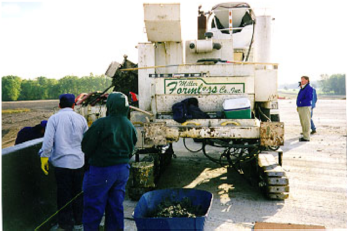
Figures 8A and 8B: Typical "slipform" concrete barrier operation.