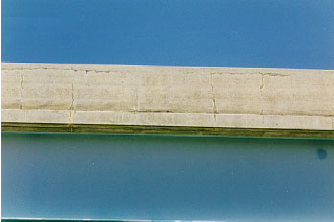
Figure 20: Typical horizontal crack deterioration noted within three years after barrier construction (WB I-496 over the Red Cedar River in Lansing). These tensile stress cracks in slipform barriers are a result of early-age stresses developed from slumping plastic concrete.

A concern that contributes to poor performance of slipform barriers is the lack of the ability to conduct thorough quality control construction inspections to assure minimum protective concrete cover over reinforcing steel prior to slipform concrete placement. Figures 21A and 21B show typical deterioration due to insufficient concrete cover over black reinforcing steel. Further aggressive concrete deterioration and corrosion of black reinforcing steel as a result of inadequate protective concrete cover at the toe of the barrier may be further aggravated by impact and abrasion brought on by highway snow removal equipment.