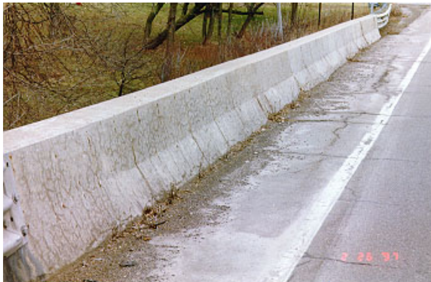
Figure 4: Typical New Jersey (Type 2) concrete barrier adopted in 1976.

Figure 4 illustrates a typical New Jersey (Type 2) detail configuration. Differences between the two standard design configurations (G.M. vs. New Jersey) are dimensional modifications to the toe and sloping face of the traffic bearing side. The cross-sectional widths at the top and bottom of the New Jersey (Type 2) barrier were also increased to 1'-0" and 1'-10", respectively. Several revisions to the standard design were adopted during the 1970's, including optional tube railings.