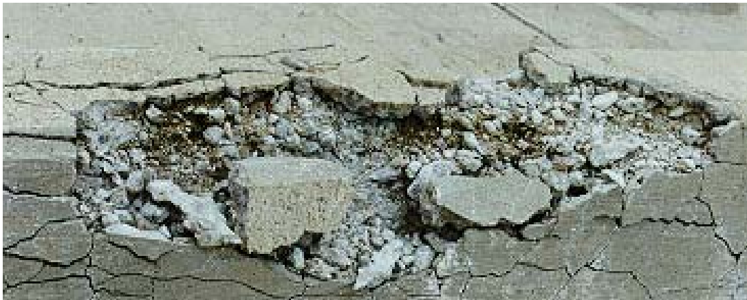
Figure 22A and 22B: Median barrier on I-94 west of State Road in Ann Arbor.