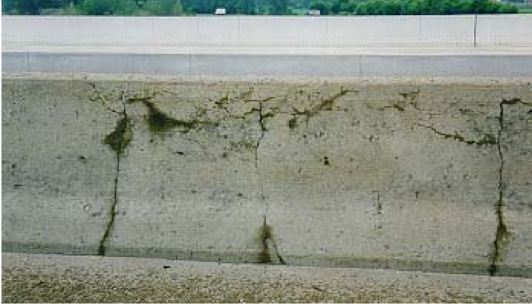
Figures 17A and 17B: S01 of 19042, EB I-69 over US-127 near Lansing, MI. Constructed in 1985, this slipform concrete barrier was constructed at the same time, using the same materials as the cast-in-place barrier described in Figure 16. The type and magnitude of distress is typical of slipform barriers in Michigan.