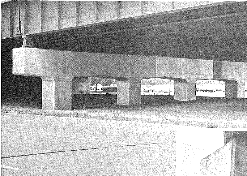
Figure 3. Good appearance of pier concrete after coating application. Left portion coated; right-yet uncoated (same pier as above).