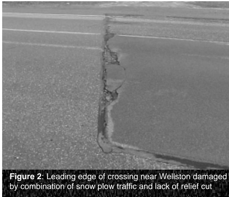
Figure 2: Leading edge of crossing near Wellston damaged by combination of snow plow traffic and lack of relief cut

Due to the relatively close proximity of the KRC to the Mohawk test locations, these crossings were regularly monitored throughout the course of the last two winters. In addition to monitoring these crossings, several different controlled field tests were performed on samples us-