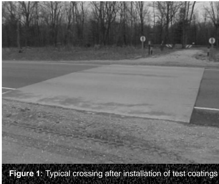
Figure 1: Typical crossing after installation of test coatings

respective products to a crossing location specified by MDOT personnel. Each manufacturer was required to have a representative present during the installation to ensure that their product was applied according to their specifications. Each test section was thoroughly sandblasted and blown clean with oil-free compressed air. Duct tape was used to establish boundaries for the products.