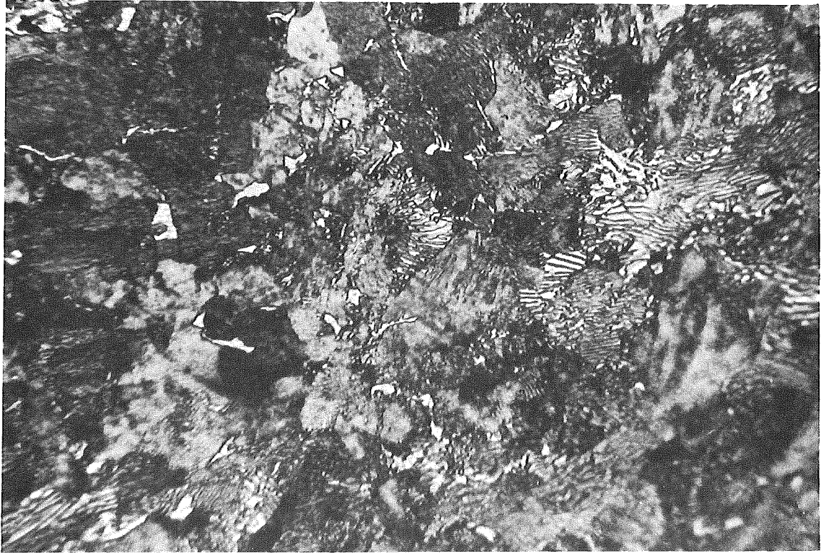
Figure 3. Microstructure of galvanized post 600X.