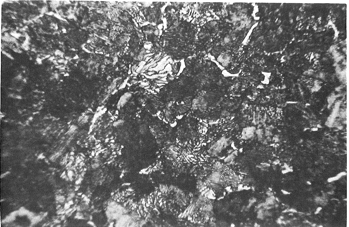
Figure 4. Microstructure of ungalvanized post 600X.