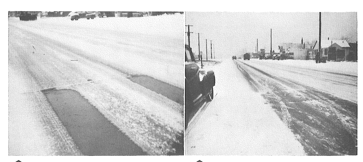
FIGURE 3. CONCRETE SECTION (1-6-50) ICY CONDITION AT END OF SECTION