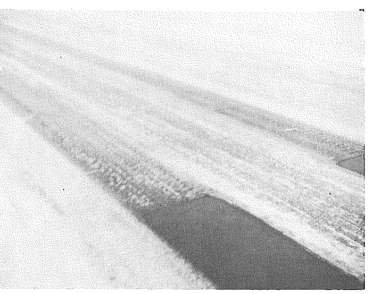
FIGURE 2. BITUMINOUS SECTION (1-6-50) ICY CONDITION AT END OF SECTION