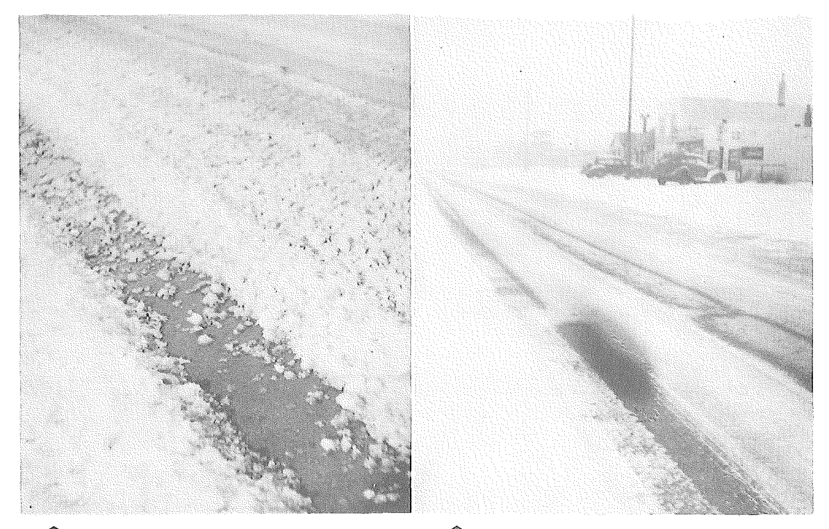
FIGURE & CONCRETE SECTION, DURING STORM (1-31-50) SOUTH TRACK PARTIALLY MELTED, NORTH LANE COVERED WITH SLUSH

FIGURE 7. CLOSE VIEW OF CONCRETE FIGURE 8. VIEW OF HEATED BIT-SECTION DURING STORM (1-31-50) UMINOUS SECTION (3-17-50) J.A.W.