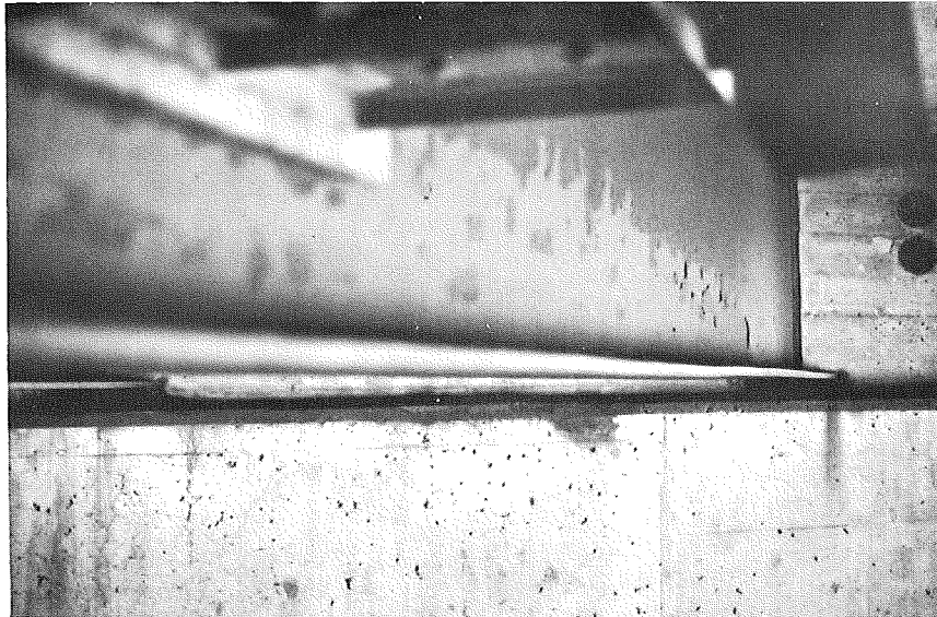
Figure 1. Combination road dirt, salt, and oxide formation shows localized descaling on A 588 steel beams.

Bethlehem Laboratory personnel stated that the behavior in "2)" above was normal and expected; and that "1)" above was higher than expected and not normal. They believed the latter was due to a measured progressive accumulation of salt and road dirt on the beam surfaces which retained moisture and accelerated the corrosion rate. This was localized because of: a) lower clearance on the west end of the structure, b) greater traffic volume on southbound I 696 in the morning when dew-moistened steel would tend to entrap road dirt, and c) snow-fence effect near west abutment wall allowing dirt to pile-up on the steel beams.