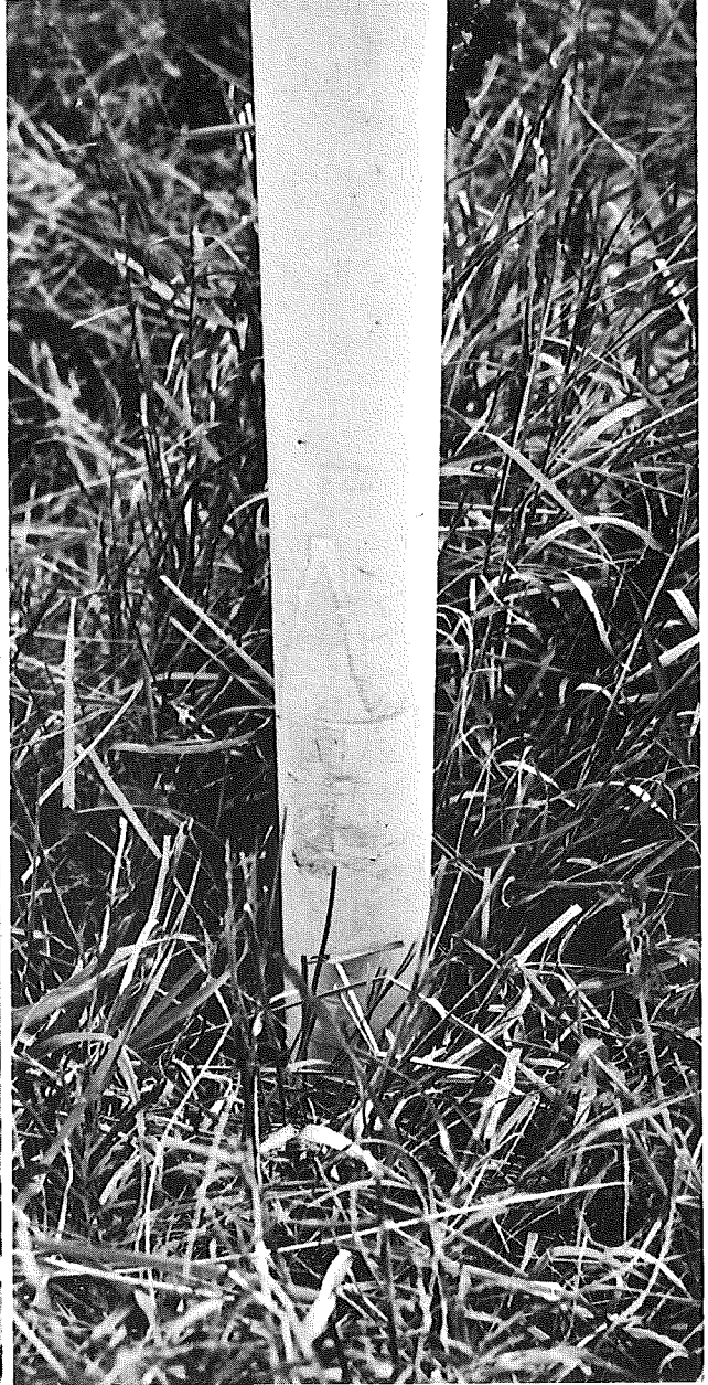
Figure 1. Post at location 10 typifies the good condition of the two white-pigmented posts after 3-plus years of service. Base of post shows impact damage that did not result in breakage.