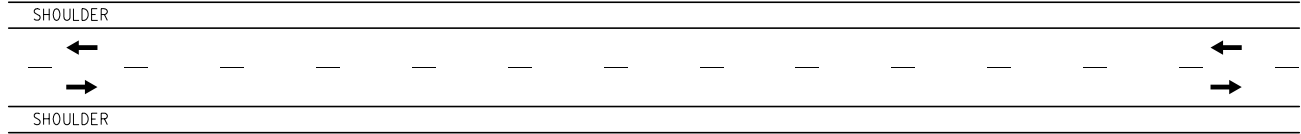
TWO LANE, TWO WAY ROADWAY