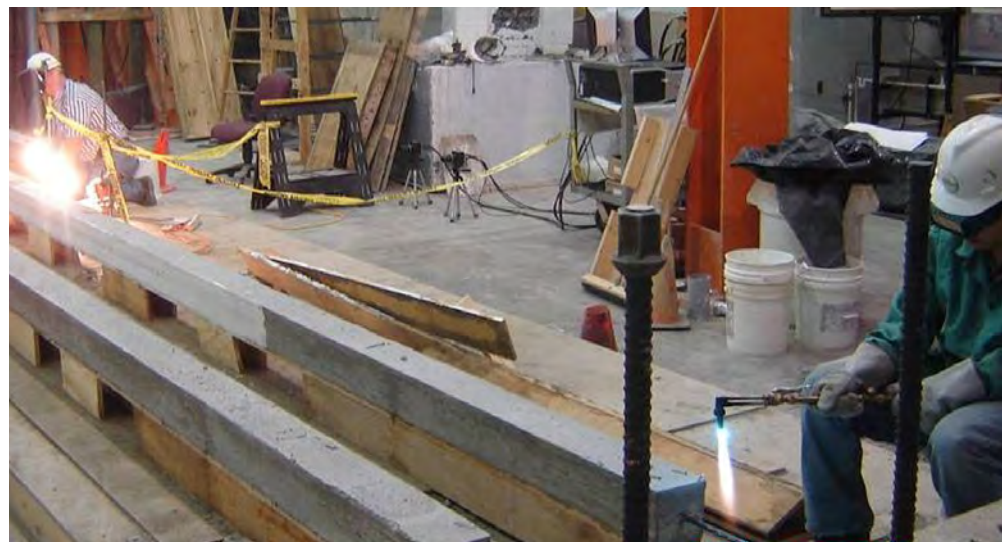
In lab testing, prestressing strands are released at both ends of the beam simultaneously.

An investigation revealed that although inspectors attributed some of the beam cracking to handling and transport, the beams met design specifications and no issues were found with quality control. New beams produced using an alternate debonding material—solid tubing rather than a slit sheathing—did not exhibit the cracking.