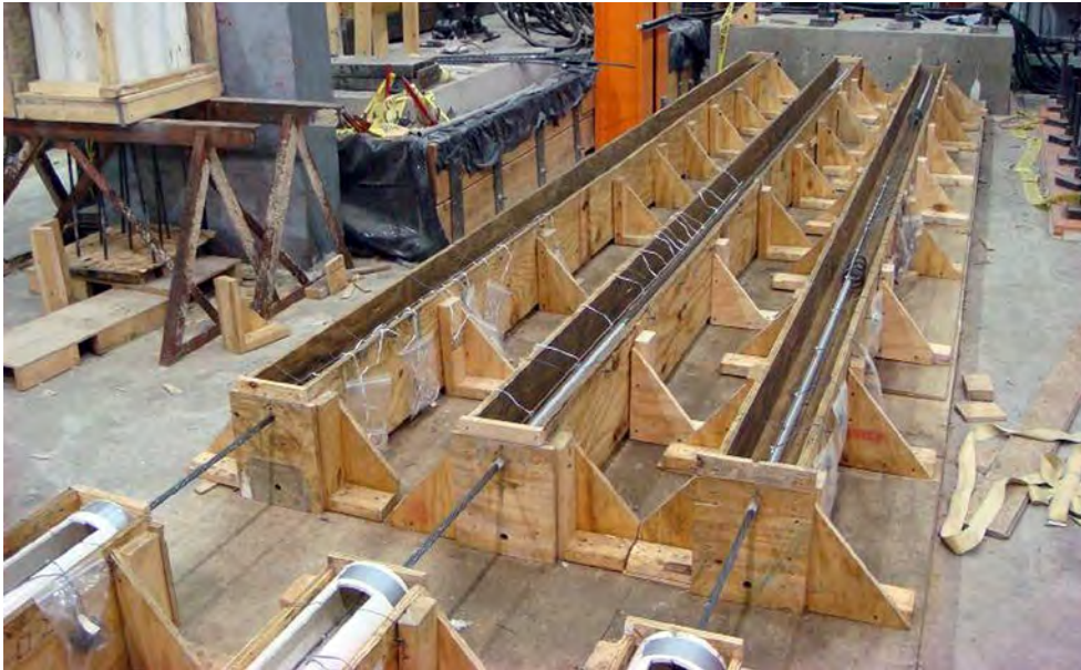
Prestressing strands are placed in the support formwork before the concrete is cast.