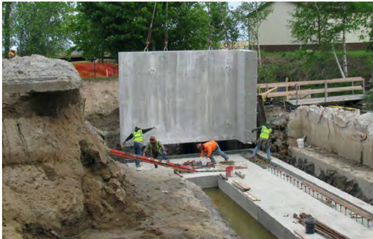
Crews work to place a precast panel so they can secure it and continue assembling a bridge abutment.

To accelerate bridge construction and shorten user delay, MDOT has been exploring the use of prefabricated bridge element systems (PBES). PBES uses fully cast prefabricated bridge components shipped to the construction site and erected by crews. This eliminates the need to construct elaborate forms, sometimes at significant heights, pour concrete, and wait weeks for it to cure. Prefabricated bridge elements may shorten construction time, reduce the time crews spend in hazardous settings, lessen environmental impacts to sites and reduce inconvenience to motorists.