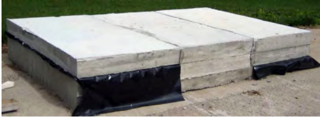
Investigators verified their damage detection algorithms with the aid of artificially delaminated concrete slabs.

As bridge decks age, MDOT must make decisions about how and when to repair them with limited resources. Such decisions require good data about the condition of decks and the anticipated costs and benefits of different repair options.