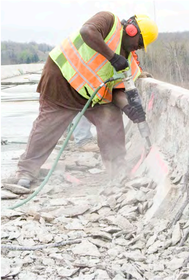
A research project expected to conclude in October 2012 will help prioritize bridge maintenance projects like this one in Cheboygan County.

Deterioration of reinforced concrete bridge decks remains a challenge for state DOTs around the country, including MDOT. In climates that require the use of deicing materials in winter, chloride penetration through cracks in deteriorated decks leads to steel reinforcement corrosion as well as concrete cracking and spalling.