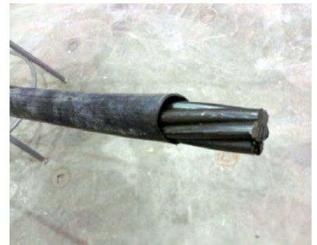
Traditional soft sheathing on the ends of prestressing strands (left) was not producing the desired debonding effect in bridge beams. The use of rigid tubing (right) as an alternative made the difference.

are unwelcome at the ends, where they can lead to cracking. Consequently, engineers cover a portion of the ends of the steel strands in plastic sheathing. This prevents these portions of the strands from bonding with the concrete and applying stresses to the beam ends.