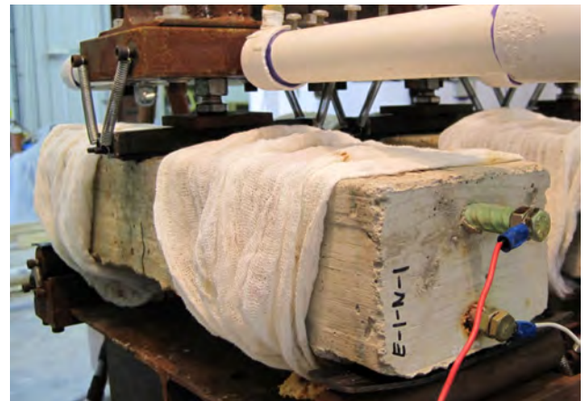
Researchers subjected ECR specimens to fatigue tests in the lab.

available at www.michigan.gov/documents/mdot/MDOT_Research_Spotlight_ECR_Bridge_Decks_Part_1_356768_7.pdf (Part I) and www.michigan.gov/documents/mdot/MDOT_Research_Spotlight_ECR_Bridge_Decks_Part_2_356769_7.pdf (Part II). The research reports are available online at www.michigan.gov/mdot/0,1607,7-151-9622_11045_24249-257449--,00.html .