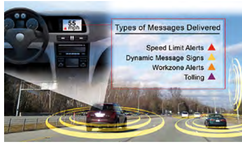
A variety of V2I messages are delivered for display as vehicles travel through the test bed.

Learn more about the V2V and V2I Technology Test Bed project at the RITA Web site at www.its.dot.gov/connected_vehicle/technology_testbed2.htm .