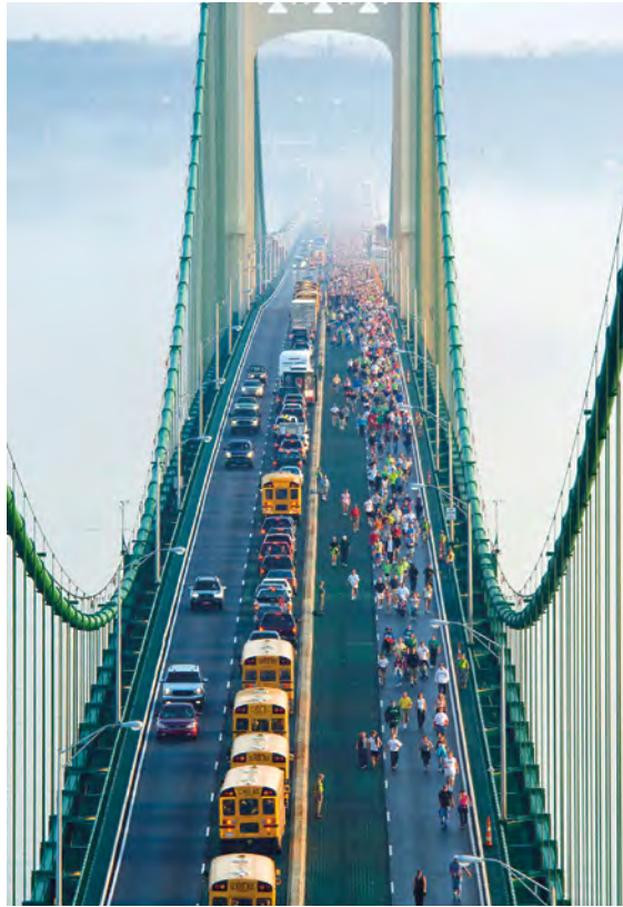
The annual Labor Day Mackinac Bridge Walk provided researchers with an opportunity to test data collection through a wireless network.

The success of the pilot system in gathering, delivering and processing high-speed, real-time data led to the permanent installation of eight strain gages at critical locations near the south