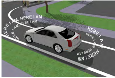
Wireless connectivity allows cars to tell other vehicles where they are located at all times.