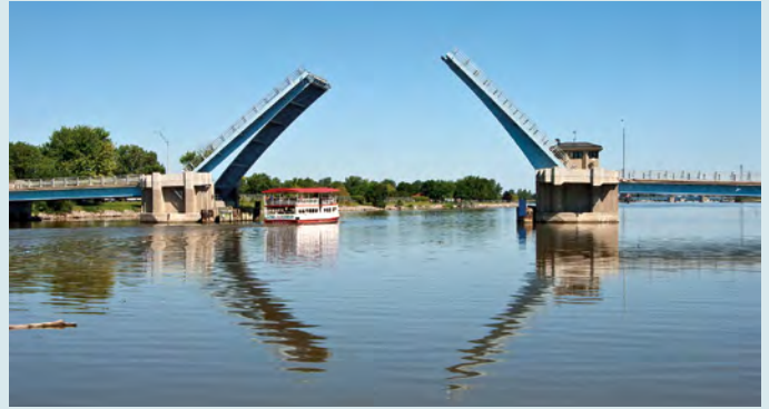
Completed in 1938, the Lafayette Avenue Bridge over the Saginaw River is one of the state's three bascule bridges equipped with monitors.

Local agencies obtain information about bridge status through a direct server connection. The public sees bridge status in real time on MDOT's Mi Drive Web site, an online resource for Michigan traffic and roadway construction information. On the Mi Drive site at www.michigan.gov/drive , bridge icons change colors