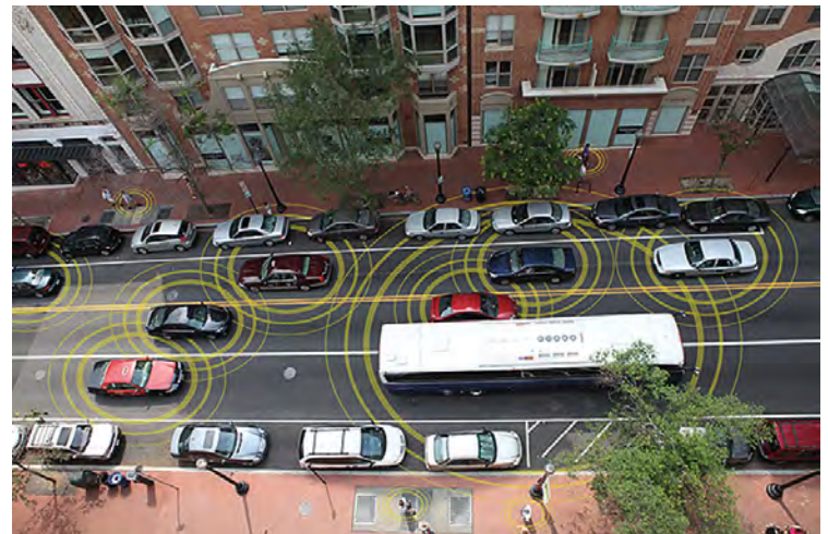
Researchers use Michigan's test bed to evaluate the wireless communication that has the potential to connect all transportation modes.

The test bed's communications network includes 55 roadside equipment (RSE)