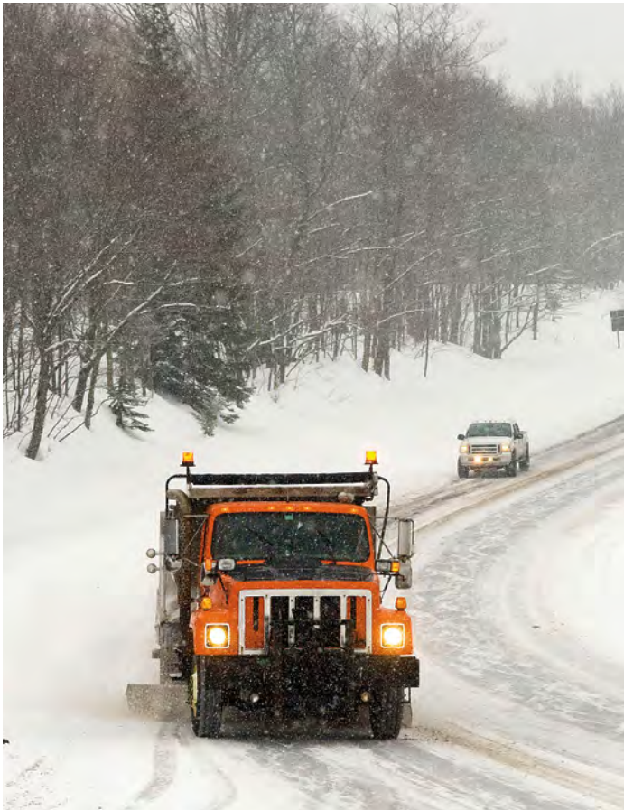
This project will help determine the potential for a full-scale deployment of probe vehicles to monitor winter driving conditions.

The tools in state DOT arsenals for fighting winter storms continue to improve—from better-designed snowplows to more effective, environmentally-friendly deicing chemicals. A research project under way at MDOT seeks to develop another tool for MDOT’s snow-and-ice-fighting toolbox.