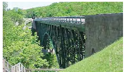
The Cut River Bridge, site of one of the bridge monitoring locations, is one of only two cantilevered deck truss bridges in Michigan.

This research project—“Infrastructure Monitoring Data Management”—is expected to conclude in spring 2012. Contact Project Manager Steve Cook at cooks9@michigan.gov to learn more about this ongoing project.