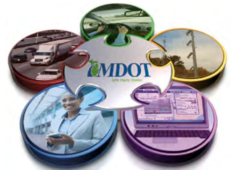
MDOT's investment in connected vehicle technologies holds the promise of a safer, smarter and greener transportation system.

MDOT's vision is for Michigan to be the home of connected vehicle research,