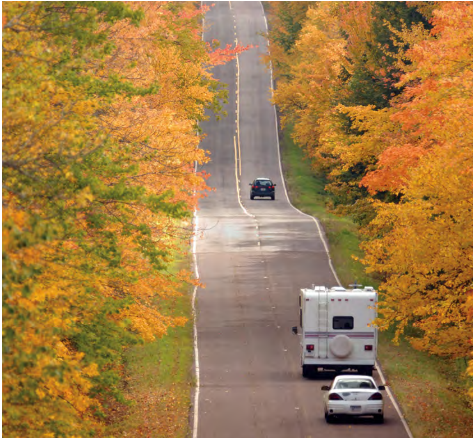
Ontonagon County, Michigan

Research Summit: May 10, 2012, is the date of MDOT's biennial research summit at the Kellogg Hotel and Conference Center in East Lansing. The summit will bring together members of Michigan's transportation research community to share information and expertise as participants examine and refine proposed research ideas that address critical MDOT challenges. Save the date and plan on attending to provide input on the topics that will be part of the 2014-2015 research program.