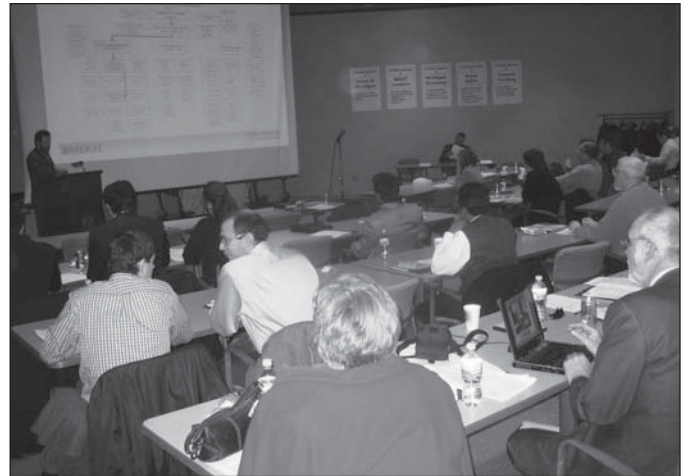
Figure 1: In February, MDOT provided university research partners from across the state a preview of the new process for managing SPR, Part II, Program research. The process is described in detail in a revised Research Administration Manual, due out this summer.

tober 1, 2008. ORBP has held meetings both internally and with its university research partners from across Michigan to explain the most significant changes and to collect input and feedback.