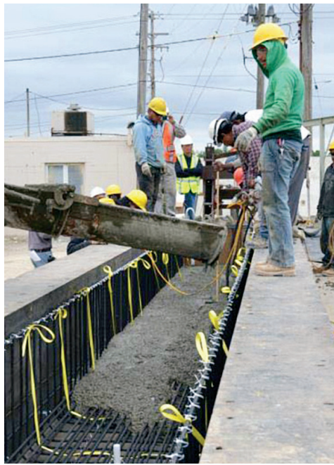
As part of an AASHTO Innovation Initiative, MDOT replaced the Plum Creek Bridge in Detroit with a CFRP-prestressed structure, a measure expected to reduce maintenance dramatically.