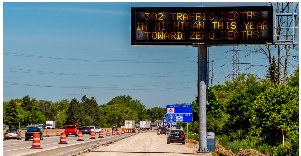
MDOT has been a champion in supporting TZD and the safety culture in Michigan.