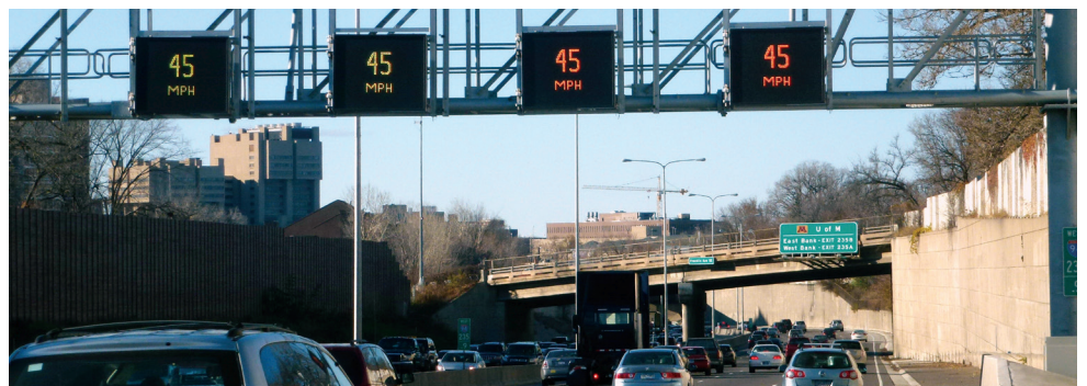
Lessons learned from Minnesota’s use of ATM are informing MDOT’s efforts to install a similar system on US-23. That project, which is expected to be operational in 2018, will improve traffic flow and safety during peak-hour congestion.