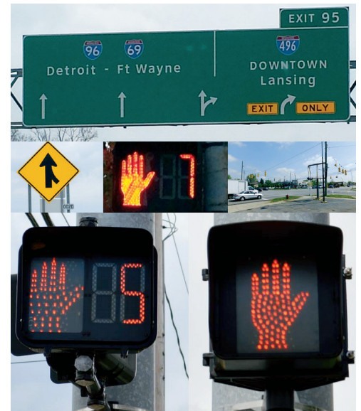
MDOT received a 2016 “Sweet Sixteen” award for establishing the benefits of measures taken to increase safety among elderly travelers. One improvement, adding countdowns to crosswalk signs, both improved the safety of elderly pedestrians and reduced the risk of intersection crashes for elderly drivers.

MDOT also received a Sweet Sixteen award in 2012 for a related study that developed strategies to keep older travelers safe and mobile, and in 2013 for a project that investigated best practices for improving the safety of bicycle and pedestrian facilities. As part of its ongoing