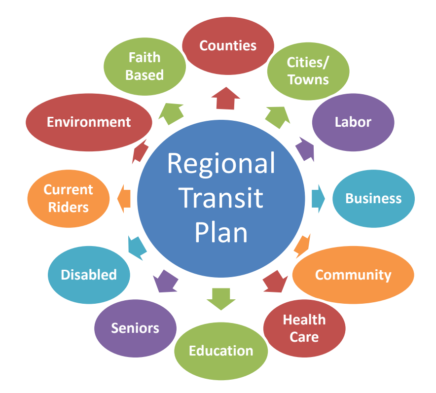
Figure 4. Phase 3: Advocacy of Regional Transit Plan by Leaders to Stakeholder Groups – Serving: presentation of the dish is important