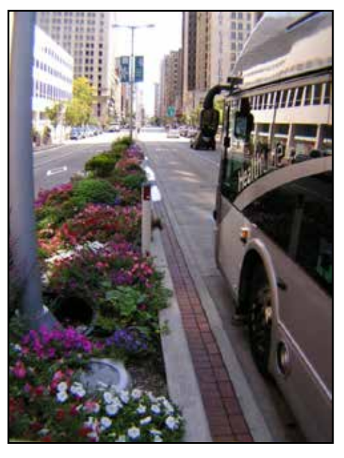
Figure 5. View Along Cleveland's HealthLine BRT Route Source: Euclid Ave. Authors' photo, 2012.

One example of effective support is the campaign leadership of Dr. Delos "Toby."